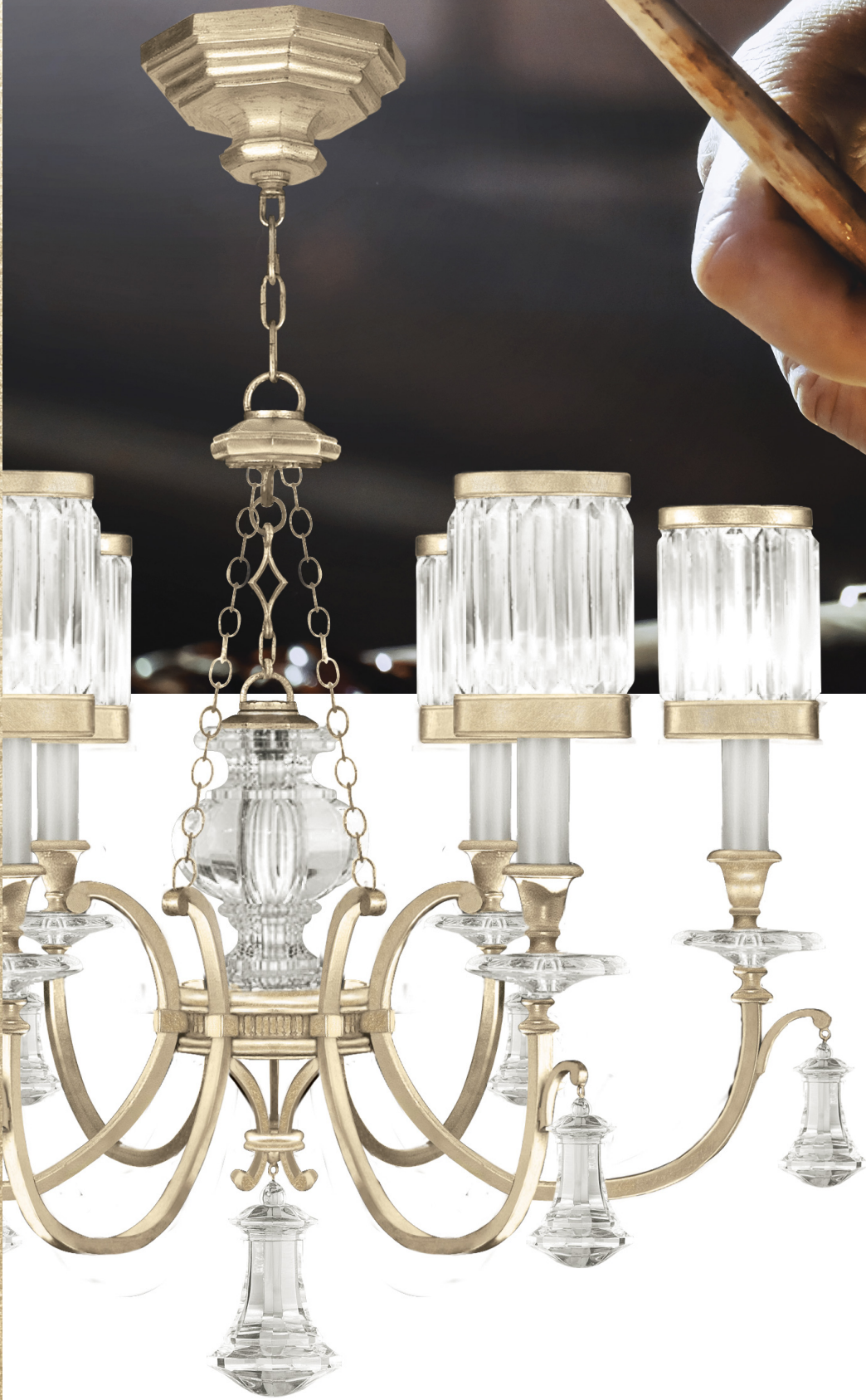
Original Eaton Place Model No. 595440 in rich, dark brown patina