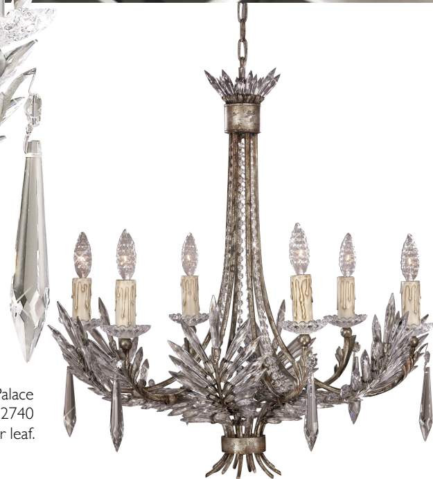
Original Winter Palace Model No. 302740 in warm silver leaf.