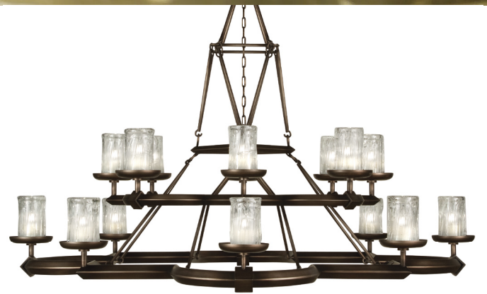
Original Liaison Model No. 860540 in antique, hand-rubbed bronze.