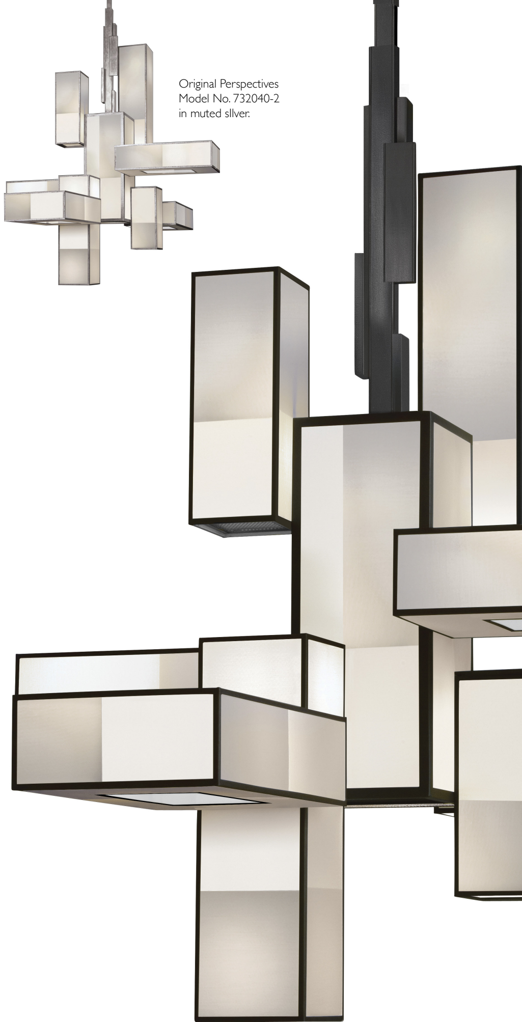
Original Perspectives Model No. 732040-2 in muted silver.