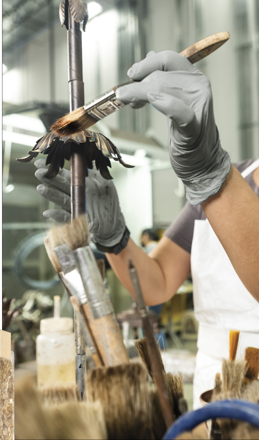
Original Terra Model No. 896750-3 in soft gold leaf.